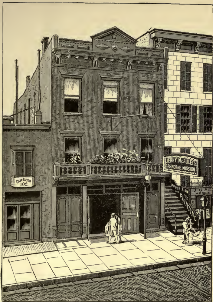
CREMORNE McAULEY MISSION; 104 West 32d Street, near Sixth Avenue, New York.